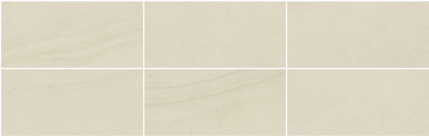
Wander White 12" x 24", 24" x 24", 24" x 36" 2CM Pavers , 25pc Mos