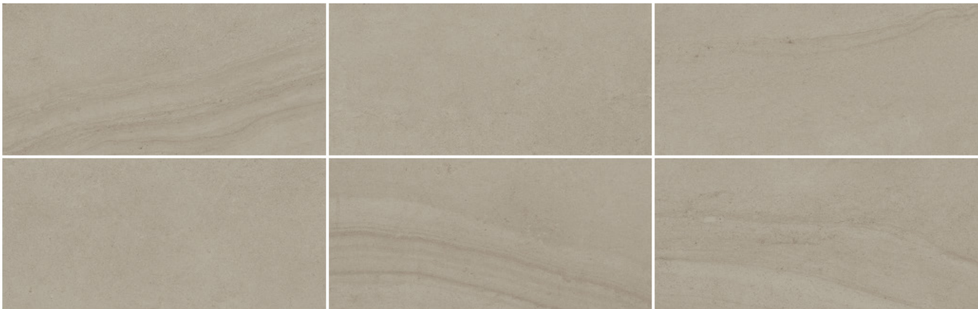
Leisure Grey 12" x 24", 24" x 24", 24" x 36" 2CM Pavers , 25pc Mos